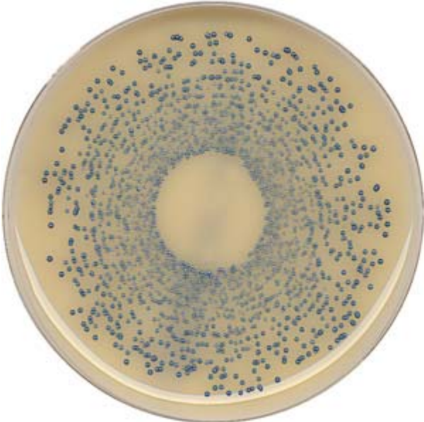
MRSA on Brilliance MRSA AGAR